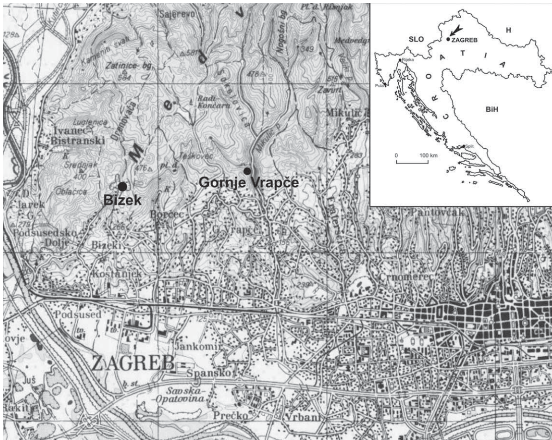
Figure 1: Map of the investigated Litavac quarries in the Zagreb area, Croatia.

(WALKER & JACOB), Elphidium fichtelianum (D'ORBIGNY) and rare planktonic forams), ostracods ( i.e. Cytheretta tenuipunctata dentata BRESTENSKA), bryozoans, hydrozoans and corals ( Flabellum sp.), denoting a shelf palaeoenvironment within the infralittoral to shallow circalittoral zones (VRSALJKO et al., 2007a, c,d). The skeletal fragments are cemented with calcite.