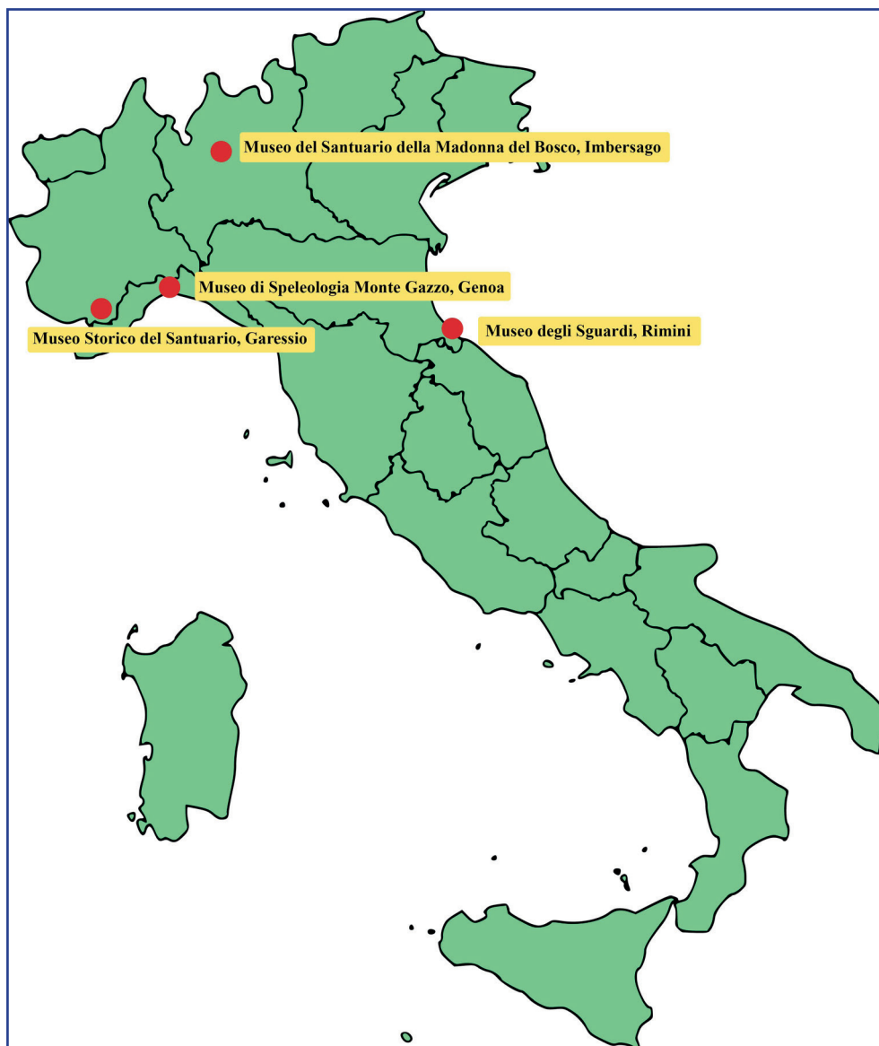
Map 1: Location of Case Study Sites

Based on https://upload.wikimedia.org/wikipedia/commons/3/36/Italia_settentrionale.svg