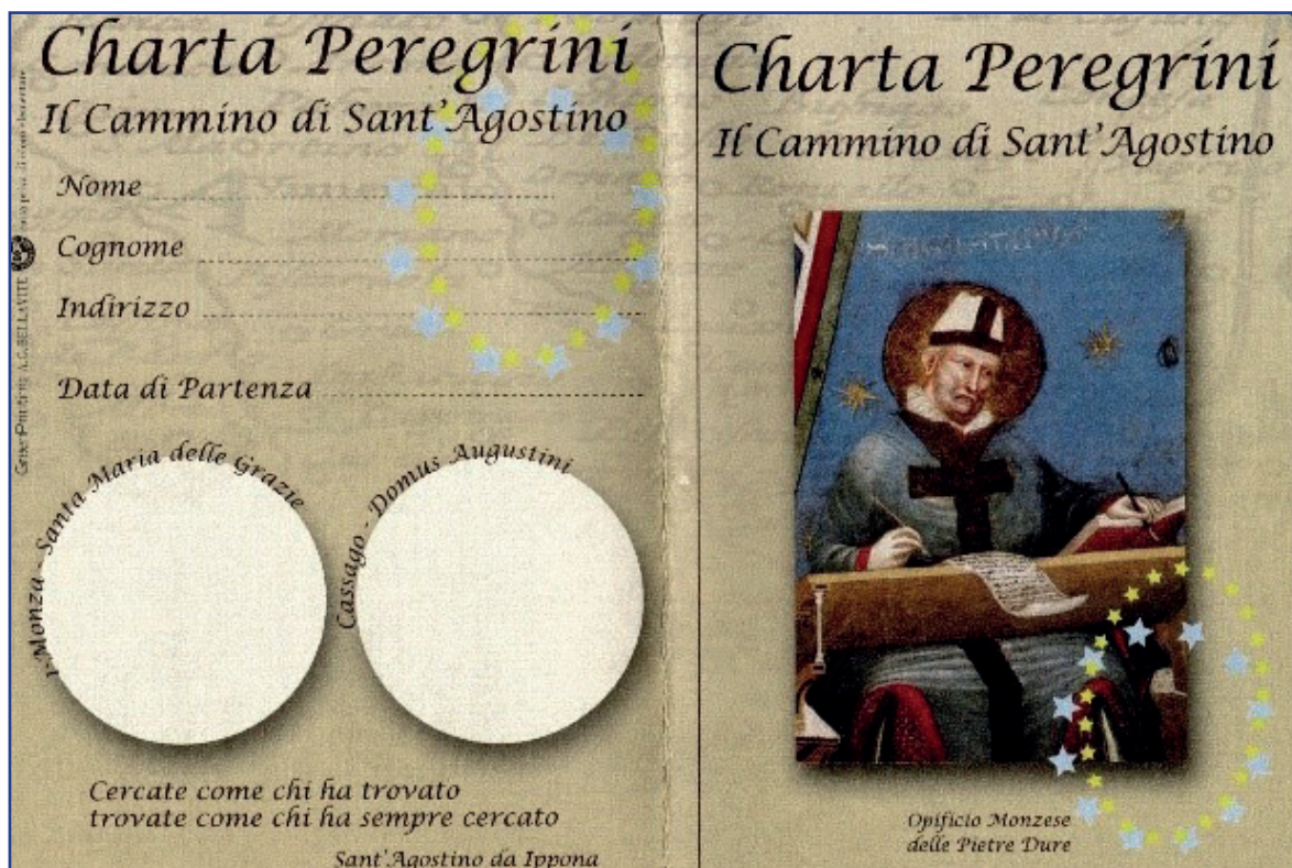
Figure 2: The Charta Peregrini of the Cammino di Sant'Agostino

The museum. What motivated the opening of a small museum in the mid-1950s was the special devotion felt for the Archbishop of Milan, Cardinal Ildefonso Schuster (1880-1954), who was particularly fond of the Madonna del Bosco . The cardinal's bedroom furniture was moved from his official Milanese residence to a room next to the shrine, which then became the core part of the new ecclesiastical museum. A number of ex-votos, paintings, and religious objects belonging to the shrine were also put on show (Perego, 1993). However, since its building the museum has always received fewer visitors than the shrine. It only registered an increase in visitation on the occasion of the beatification of the aforementioned Cardinal Schuster, which took place in Rome on May 12th, 1996. The sanctuary, in contrast, has always attracted visitors – mainly from Lombardy and the Swiss Cantons of Ticino and Grisons, followed by other North Italian regions (Bagnoli & Capurro, 2009). Peak