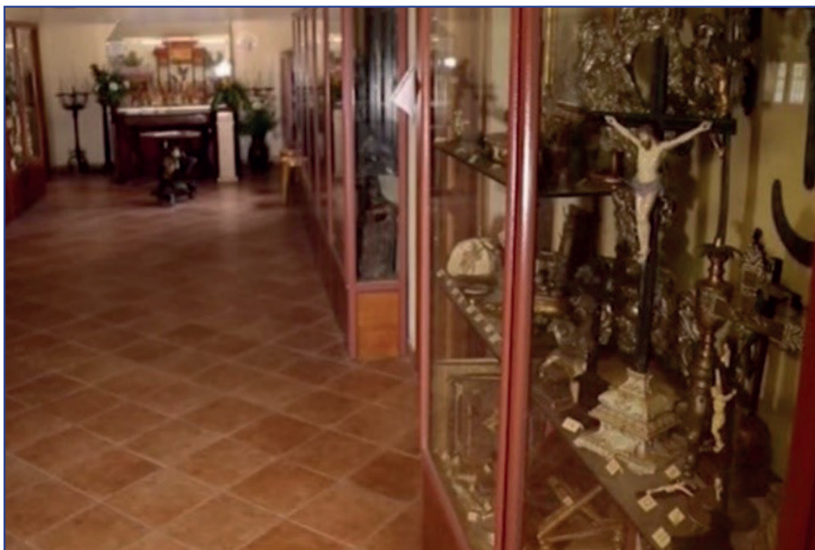
Figure 4: Religious objects on display at the convent of Santuario delle Grazie , Rimini

Returning to the Museo degli Sguardi , this was planned under the supervision of a scientific committee directed by Marc Augé, former director of the Ecole des Hautes Etudes in Paris. The museum that was created presents a very original museum-narrative tracing different points of view of different cultures (Montorsi, 2004). Presently, the museum is often closed, opening only for special events or temporary expositions. As such, visiting the museum is a rare event. Dr. Maddalena Mauri, manager of the Department of Museums for the Municipality of Rimini, emphasises that the audience of the Museo degli