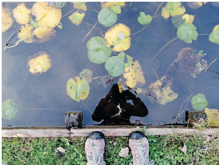
Figure 2: Self-portrait during the pandemic crisis.

or to realize interdependent self-portraits where my figure is entangled with the environment (Figure 2) to develop my ability and power to imagine the world for myself, because as a woman I am aware that I am subject to the problematic imagining of others (de Beauvoir, 1949).