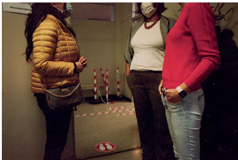
Figure 5: The three adult learner protagonists of the interview, October 2020

constructed, flooded with inter-discursivity, and that it constructs and constitutes local action and meaning-making in the rich ecologies of learning and living” (Evans, 2021, p.42). As such, our time together became more than an interview, because the students not only told the story of their return to education, but they also shared emotions and struggles that relate to their social roles and status.