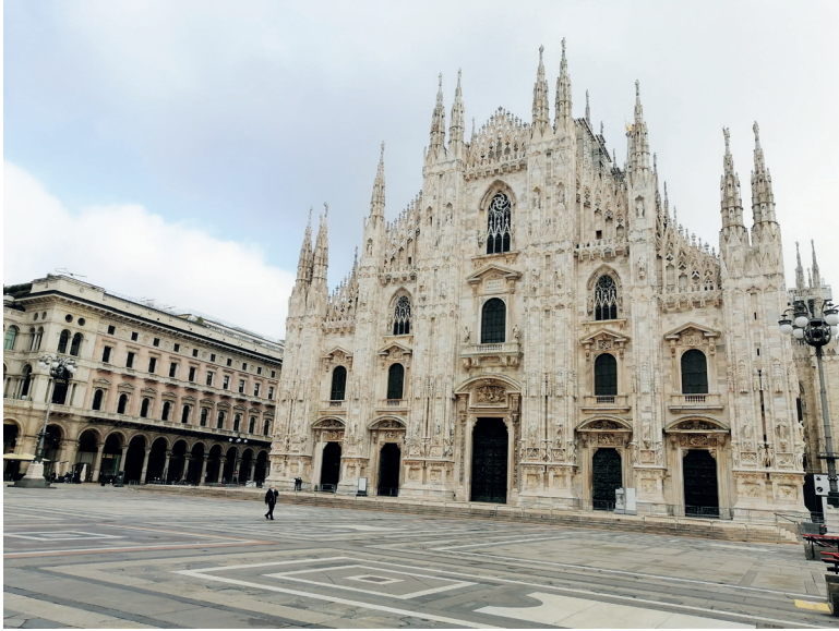
Figure 1: Piazza del Duomo, Milan, October 2020.

Piazza del Duomo, and I also perceived my desire to imagine new ways of telling life and the world about the interdependence of humans and the environment. To fix this poetic moment, I took a picture with my smartphone (Figure 1).