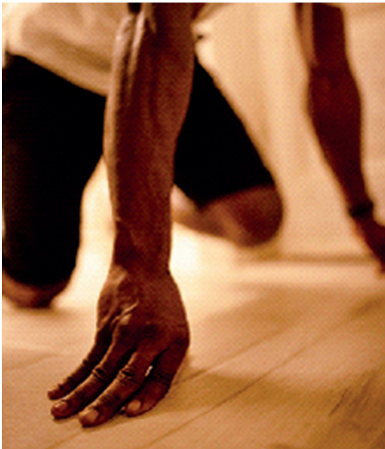
Figure 4: Student photographed at the end of the interview, June 2020