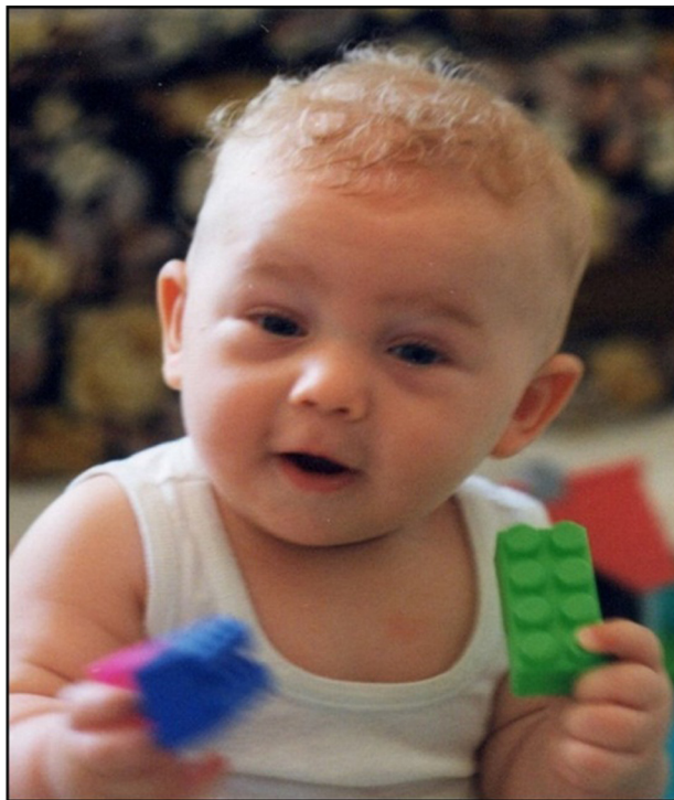
Figure 2 Facial features of the patient. Note: Our patient at the age of 13 months.

In the last few years, the use of comparative genomic hybridization array refined the molecular bases of developmental disabilities and psychiatric disorders associated with chromosome deletion/duplication. 8,9