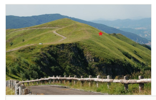
Figure 1. Study area of Mt. Lesima (Northern Apennines, Lombardy region, Italy). The star symbol shows the sampled grassland.

The collection took place in a montane grassland formation with a north-eastern exposure and average altitude of 1650 m [Fig. 1]. This grassland is situated in the Lombardy side of Mt. Lesima, 44°41′6 N 9°15′26 E (a slope of the mountain is included in Emilia-Romagna region). Mt. Lesima (1724 m a.s.l.) is included into the area southern to the Po river named Oltrepò Pavese, that consists of many hills and some higher mountains of the Northern Apennines. According to Rossetti and Ottone (1980), the average rainfalls of the area that rounds Mt. Lesima is 1250–1500 mm and the mean annual temperatures is 5 °C. In the higher peaks, rainfall level is even greater considering both the orographic-lift effect in rainy clouds formations and the effect of moisture addition to air masses by daily heating, which is more frequent in the summer. The Temperate Oceanic Submediterranean bioclimate is the prevailing climate type in the mountainous area.