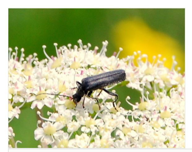
Figure 5. Limonius minutus (Linné, 1758) feeding nectar: it is obvious the contact between the mouthparts and the exposed nectaries of Lasepitium siler (Apiaceae).