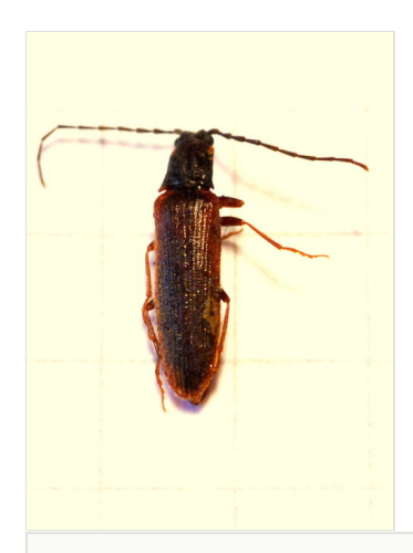
Figure 2. C. homalisinus of the picture was collected foraging on flowers of Laserpitium siler (Apiaceae).

Data collected on Mt. Lesima yielded the first record of Campylomorphus homalisinus (Illiger, 1807) inside Lombardy (Italy) [Fig. 2]. A male specimen was recorded foraging on a flower ( Laserpitium siler , Apiaceae): according to the literature, a flower foraging C. homalisinus has never been recorded before this sampling.