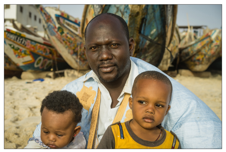
A family at the Fisherman's Beach in Nouakchott, Mauritania.