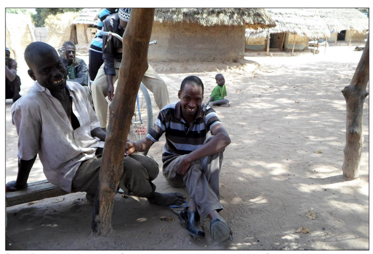
Sare Dembayel, upper Casamance region, southern Senegal in 2014. Photo by author. All rights reserved.