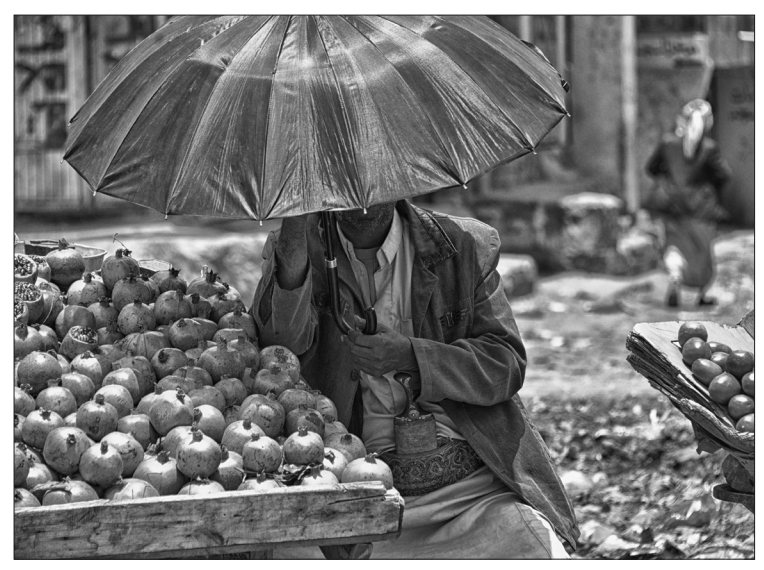
Pomegranate seller, Yemen.

of them dwelled in rural areas of western and southern Yemen. However, after the 1962 revolution establishing the Yemen Arab Republic, many akhdam were compelled to work as salaried street-sweepers in major cities.