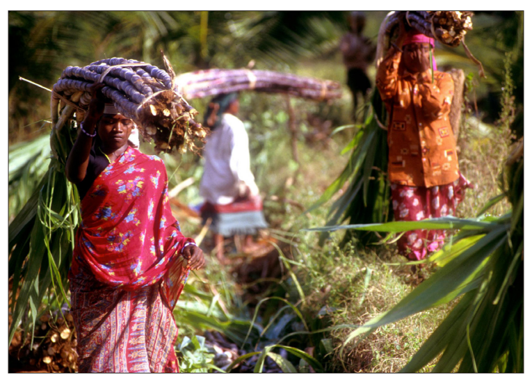
Harvesting sugar cane in India.

slavery programme. One of our most arresting findings was that the people most likely to work in slavery-like conditions tended not to be the poorest of the poor.