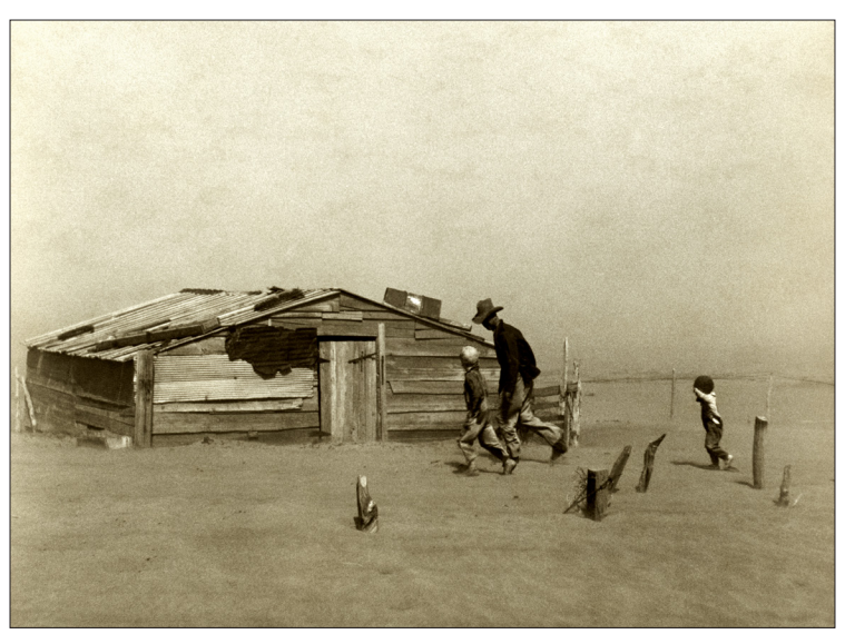
Cimarron County, Oklahoma, USA, 1936. Public Domain.

known as effective 'agriculture value chains': i.e. the integrated range of value adding activities that theoretically should link farmers to new global or regional markets, improve and 'rationalise' agricultural production, and keep prices low for a growing global population.