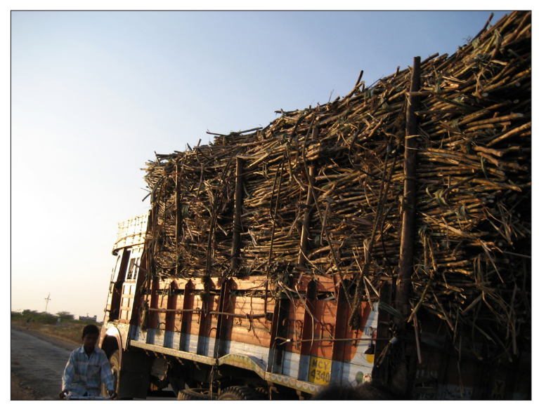
Truck transporting sugar cane.

theory, Kaziba is responsible for providing outgrowers with training, improved seeds, fertiliser, and services to transport and harvest sugarcane. The association is also in charge of annual negotiations with the company on the price for sugarcane.