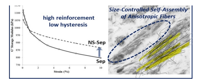
Fig.1 Storage modulus G' vs Strain of NS-Sep/SBR and schematic representation of NS-Sep self-Assembly

In this context, we explored a new approach to prepare PNCs based on nano-sized sepiolite (NS-Sep) fibres [1]. Pristine Sep was structurally modified by an acid treatment, which provides NS-Sep fibers with reduced particle size and increased silanol groups on the surface layer. NS-Sep fibers were used to prepare styrene-butadiene rubber (SBR) NCs with enhanced mechanical properties. Dynamic-mechanical analysis of Sep NCs demonstrated that the modified Sep fibers provided an excellent balance between reinforcing and hysteretic behavior compared with large-sized pristine Sep (Fig.1) and isotropic silica.