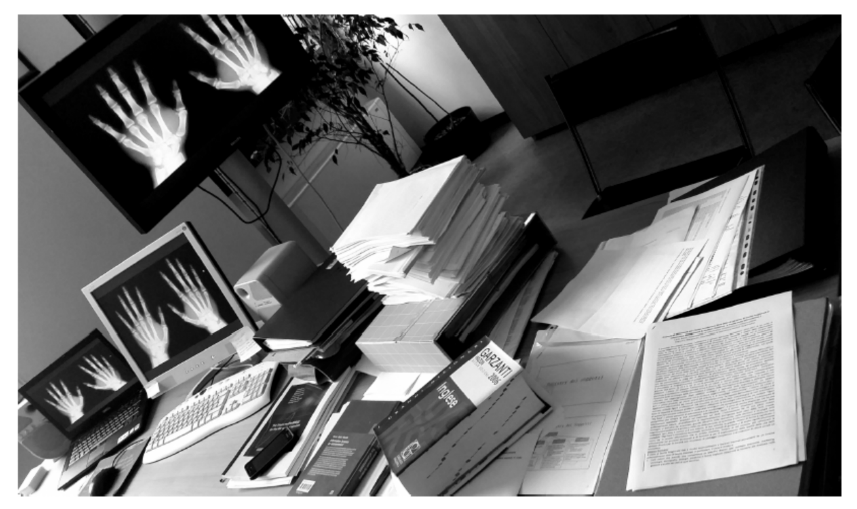
© Springer International Publishing Switzerland 2016