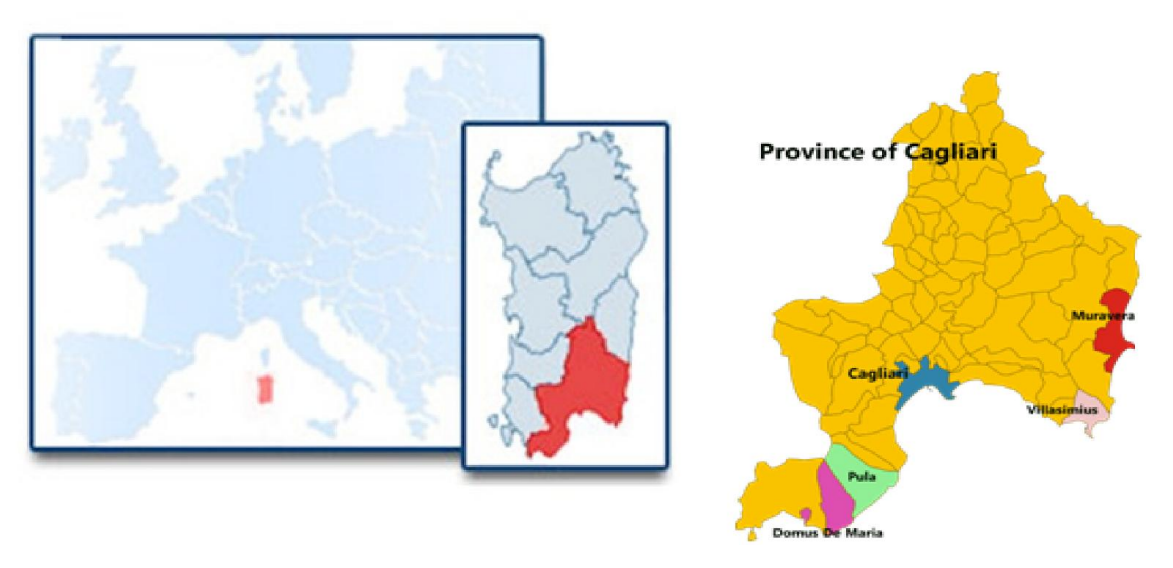
Figure 1. Map of the Province of Cagliari, Sardinia, including the five municipalities of the DMO, Visit South Sardinia.

The following section outlines general features of the destination. South Sardinia has a total area of 473 square kilometers and is characterized by a rocky coastline spotted with sandy and rocky beaches. South Sardinia is also characterized by the presence of large floodplains that support a wide range of agricultural activities, and four large hilly areas where historic districts are located. It is also important to note the presence of wetlands, such as ponds and lagoons. The Mediterranean climate is characterized by mild winters and hot and dry summers. The population density is 395.35 inhabitants for square kilometer but this varies considerably between the different municipalities. Tourism is a key economic driver. In 2013, total annual visitors were 2,032,946, 1,183,921 of which were domestic tourists.