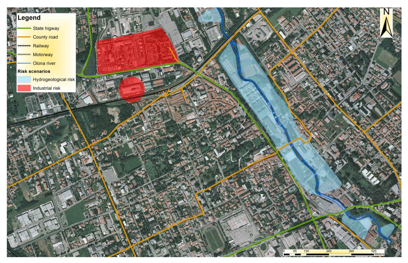
Figure 2. Hydrogeological and industrial risk scenarios.