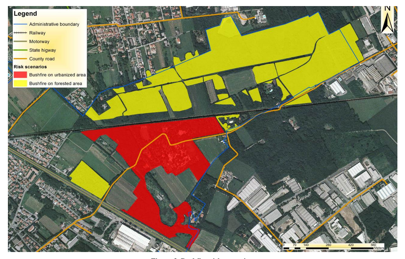
Figure 3. Bushfire risk scenarios.