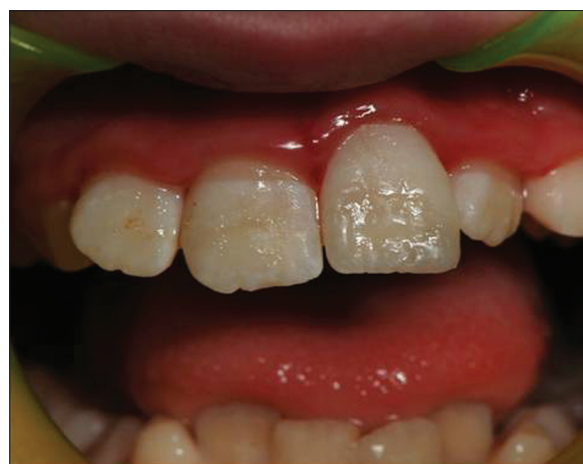
Figure 4: Clinical appearance of upper right and left central incisors after teeth fragments reattachment

of a lateral incisor retrieved in the lower lip. They defined their procedure as “first choice treatment” for coronal fractures emphasizing the importance of dental fragment storage and the multidisciplinary nature of dental trauma management. Naudi and Fung [24] reported the first pediatric case in which they described the reattachment of a tooth fragment embedded in the lower lip, 3 hours after the initial trauma. The authors reported that there were no dental and esthetic complications for over one year.