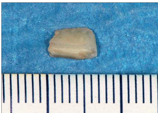
Figure 3: Recovered fragment of the upper central left fractured incisor