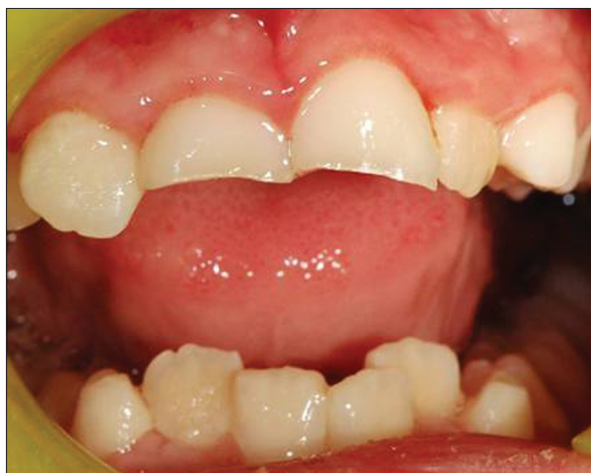
Figure 1: Clinical appearance of the fractured maxillary central incisors at presentation