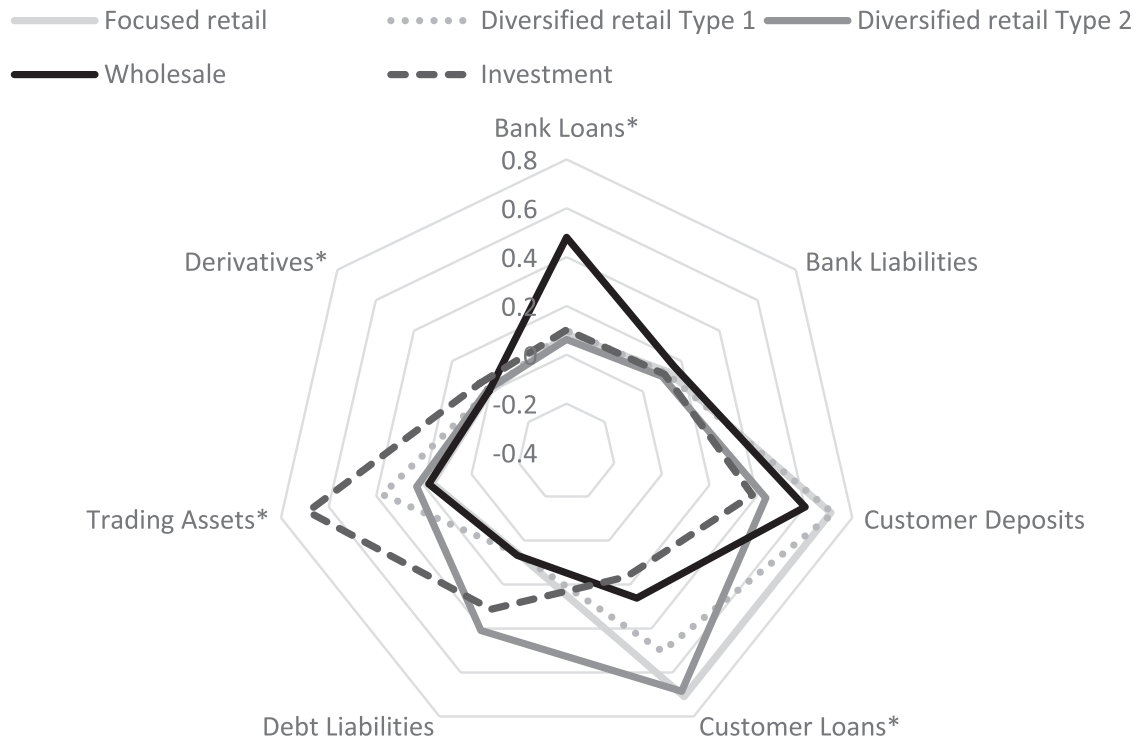
Figure 1. Bank business model definition

Note: The figure shows the differences in terms of bank assets and liabilities in the five BMs identified. The items with an asterisk are those used in the cluster analysis to define the number of clusters. Focused retail, diversified retail (type 1 and type 2) are those BMs that are more retail-oriented, which differ on the diversification of the asset and liability sides. The wholesale BM groups banks oriented to the interbank market and the investment BM groups those banks more oriented to trading activities.