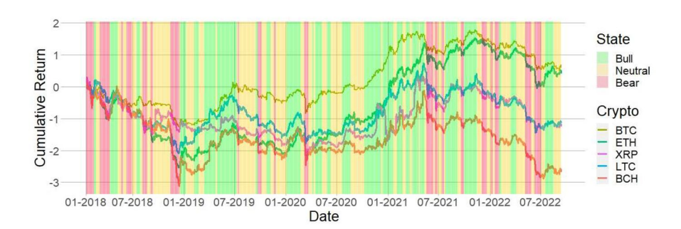
Fig. 2 Cumulative log-returns of BTC, ETH, XRP, LTC, and BCH over the period January 2018 - September 2022, together with the state sequence obtained from the SJM in green (bull), yellow (neutral) and red (bear) (color figure online)

features, all of which are stationary (see Sect. 3 for a description of the construction of the features and Appendix 1 for a complete list).