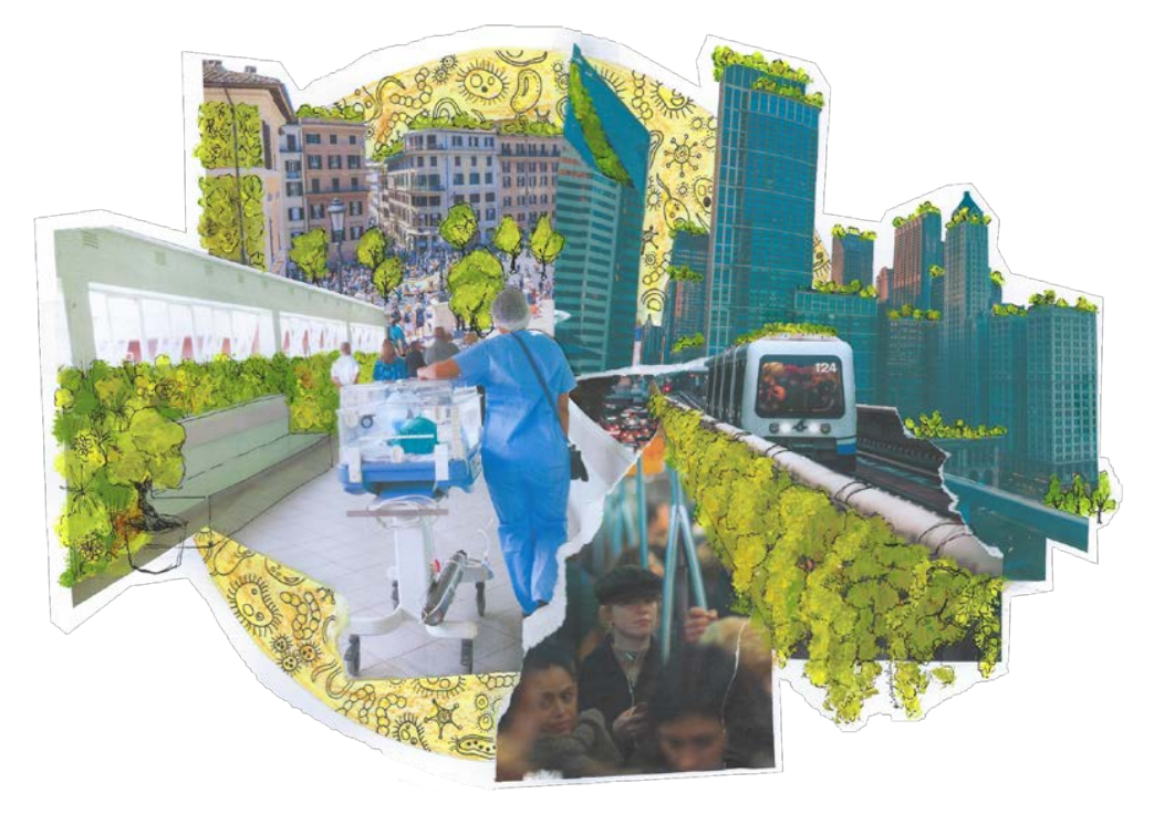
Figure 3. Rewilding today's urban centers: While designing policies to address the construction of the integrative cities of the future, we will have to transition through an intermediate phase of nature's inclusion in existing urban areas. This illustration is realized with clippings representing the city of today (a crowded square, clusters of skyscrapers, commuter subway lines, and the core of last year's public health: hospitals). The figure's layered structure represents the different tiers we must act on to renovate the current urbanization condition. On top of everything, painted vegetation is inserted in the already existing urban pattern: a call for greener living spaces is becoming increasingly essential. The microbiota (both human and environmental), represented in yellow in the background, envelops everything as the linking element between humans and the context we built and live in. Not only does our health depend on our microbiome, but its composition is heavily affected by environmental changes; just as in a collage, every piece is glued to the others.

wildlife overpasses, and community allotments can be integrated in schools and other public buildings. With precise and mindful planning, the reintroduction of autochthonous plants can be a positive side effect, able to restore a neglected biodiversity. As a natural reservoir of microorganisms producing immunoregulatory molecules, a greener life context would face the dysbiosis caused by our urban and social sphere (both in and around humans), rewilding and, thus, introducing functionally diverse microbial species [61,69]. According to the Rewilding Hypothesis, the biodiversity of microorganisms associated with natural environments can promote the restoration of the ecosystem service of immune protection, provided by the coevolution of these microorganisms with humans [70]. In some contexts, we must preserve the value and the cultural heritage of historical sites. In other cases, we have to cope with already existing structures and buildings (Figure 3). Through a precise and reasoned way to promote nature's inclusion in existing urban areas, i.e., urban renovation, we can design policies to modulate the construction of the integrative cities of the future.