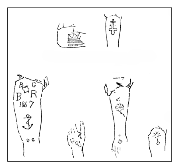
Figure 1. Reproduction of sailor tattoos by Prof. Bertè at the end of the 19th century. Source: Bertè F. Il tatuaggio di Sicilia in rapporto alla resistenza psichica , 1892.