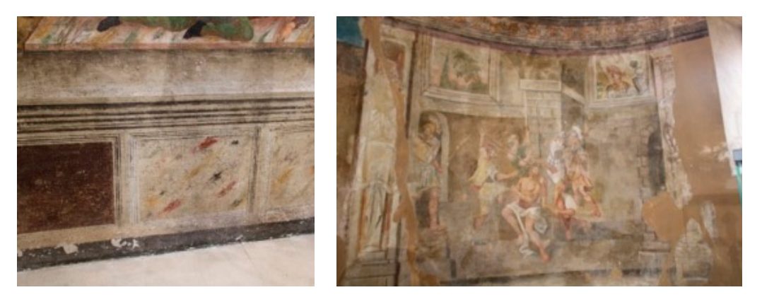
Figure 3. Examples of typical alterations found in the lower and upper portions of the apsidal basin.