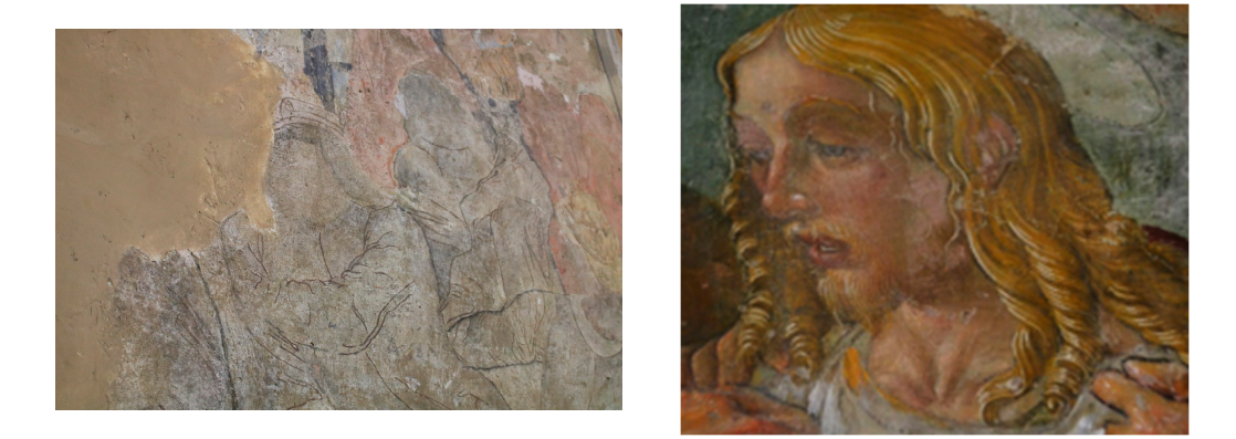
Figure 4. Examples of the several engravings visible both in the pictorial portions characterized by total collapse and in those with a good state of conservation.

This first evidence was deepened during the in situ photographic and multispectral investigation. This diagnostic approach based on multispectral imaging also allows for a better iconographic interpretation, highlighting the volumetric effects of the figures and the perspective relationships altered by degradation phenomena or repainting that has overlapped over time. Furthermore, in order to obtain a deeper identification of artist technique and understanding of the technical choices of the workshop, the study envisaged the characterization of the plasters (number of layers, type of aggregates, binders, presence of primers, etc.) through mineral–petrographic analyses.