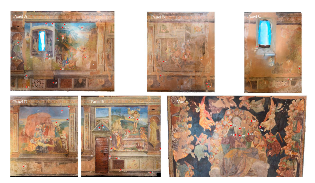
Figure 6. Panels (from left of the apse) ( A – E ) and ( vault ): Location and denomination of the areas where the 47 fragments of plaster and pictorial layers were taken. Each sampling areas have been selected on the basis of the first results of the in-situ investigations.

The following section describes the history of the building and the most relevant historical aspects about the frescoes (patronage, chronology, iconographic programme, and artistic reference models), information useful for the understanding and contextualization of the results provided by the project.