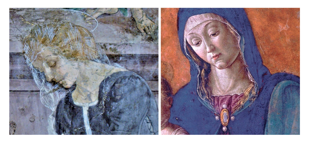
Figure 7. A comparison between Mary Magdalene in the Lamentation panel ( left ) and the detached fresco Madonna with standing Child (L'Aquila, church of Santa Margherita) ( right ) reveals identical executive technique in highlights made in "bianco di calce" (calcium white) for the finest details like the veils, and traces of gold leaf used for the gilding of halos and edges of robes.