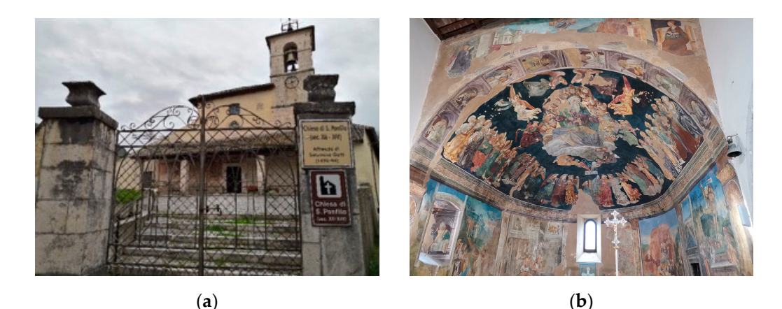
Figure 1. (a) Church of San Panfilo in Villagrande di Tornimparte in the province of L'Aquila. (b) Cycle of frescoes in the apse by Saturnino Gatti (1463–1518) object of study and research activities.

The scientific investigation campaign, whose methods and results are described in detail in the articles of this Special Issue, was identified following the technical inspection carried out by the restorers and art historians. This preliminary phase was aimed at understanding the needs in terms of knowledge and conservation features, the extension of the areas to be investigated for the documentation of the degradation and the management methods of the in situ and laboratory investigations.