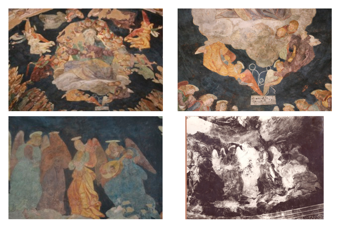
Figure 2. Details of the vault affected by a dark blue background and comparison between the current conditions and the ICR pre-intervention status in a historical image ( bottom right ).

C. Mapping of the restored areas and identification of the restoration materials that overlapped during past documented and undocumented conservation interventions. Through the integration of diagnostic imaging techniques and spectrometric analyses, the areas affected by repainting, remakes, stuccos, and protective materials applied to the original surfaces have been localized in detail. The characterization of these overlapping materials provided a guide to assess applicable treatments and the removal of materials that compromise the durability of the original layers. Particular attention was paid to understanding the blue background layer on the vault surface, heavily darkened, to evaluate what the original appearance was and how many layers and which materials were superimposed over time (Figure 2).