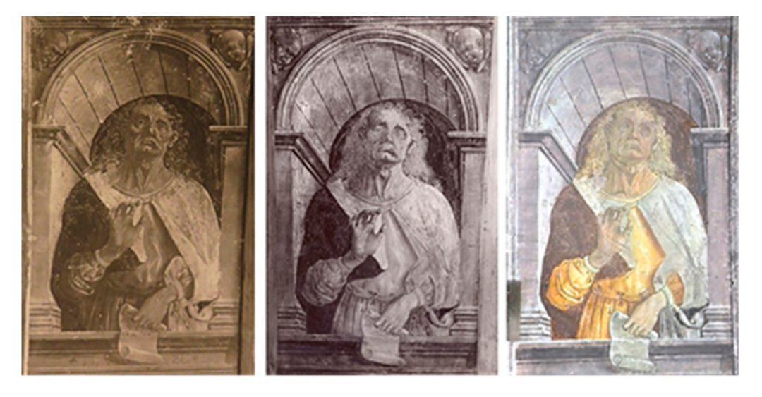
Figure 8. Prophet Daniel appearing in the sub-arch reveals, through the comparison of pictures dating back from 1920 to 2020 (from left), the almost total loss of the "a secco" finishes located in the incarnate, eyes, hair and in the scroll held in the left hand.