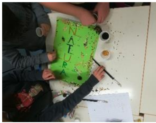
Figure 1 . Example of an acrostic created during the first meeting of the project. The acrostic is composed by "Nascosti nellA Terra Umida Respirano Animaletti" (Hidden in the moist soil little animals breathe).