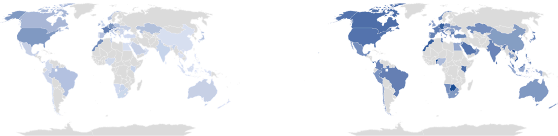
Fig. 3. Spatial distribution of stock prices: median price on the left; post-estimation residuals on the right.

selection procedure. The dependent variable from Models 1–8 is the logarithm of the median value of the average stock price of each country each year, while in Model 9, it is the logarithm of the average stock price of each country each year. Robust t-statistics are in parentheses. ***, **, and * indicate statistical significance at the 1 %, 5 %, and 10 % levels, respectively. For the definitions of the variables, see Table 1. In the Appendix, for individual variables effects, see Tables A.3, A.4, and A.5.