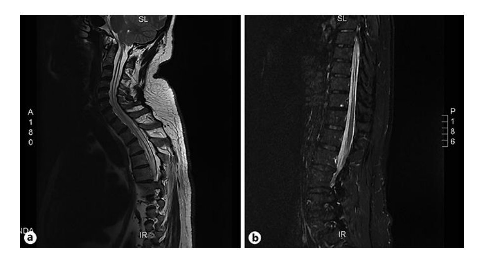
Fig. 3. Case 4. a , b T2-weighted sagittal sections of the whole spine showing a wide syrinx within the spinal cord, located around the central canal and extending from the cervical to the lumbar metamers.