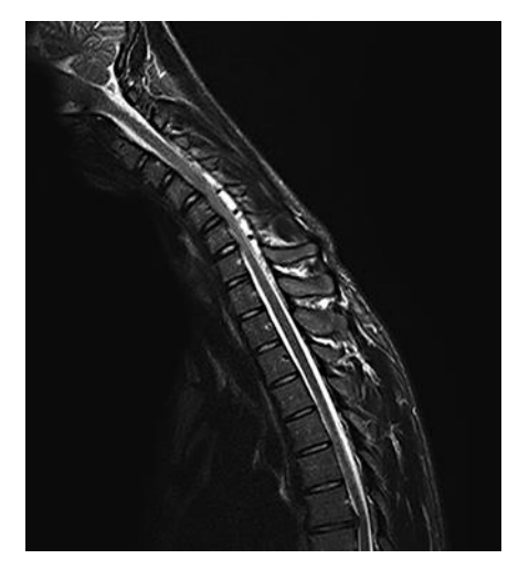
Fig. 4. Case 5. Sagittal cervical spinal cord STIR (short tau inversion recovery) flection MRI, showing anterior shift of the posterior dura with displacement from the cervical lamina between C3 and T2, associated with a minimally reduced anteroposterior diameter, predominant at the C5/C6 level, and the presence of posterior epidural venous structures.