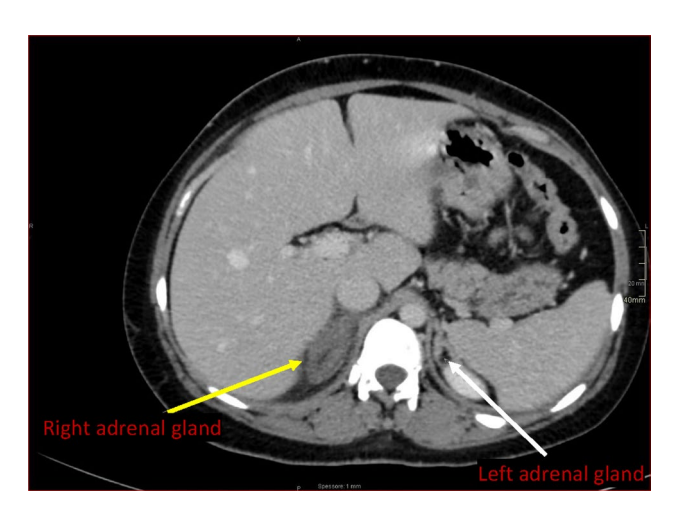
Figure 2. CT scan with contrast. CT scan displays an enlarged and edematous right adrenal gland with preserved morphology, no enhancement following intravenous contrast and inflammatory peri-adrenal fat stranding (yellow arrow). Note usual enhancement of the contralateral adrenal gland (white arrow).