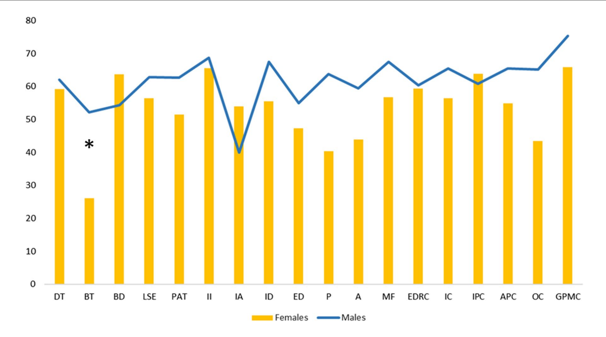
Fig. 1 Graphic representation of means of scores at subscales of EDI-3. The asterisks indicate a significant difference between conditions: *p \le 0.05 , **p \le 0.01 , ***p \le 0.005 (Drive for Thinness -DT-, Bulimia -B-, Body Dissatisfaction -BD-, Low Self-Esteem -LSE-, Personal Alienation -PA-, Interpersonal Insecurity -II-, Interpersonal Alienation -IA-, Interoceptive Deficits -ID-, Emotional Dysregulation