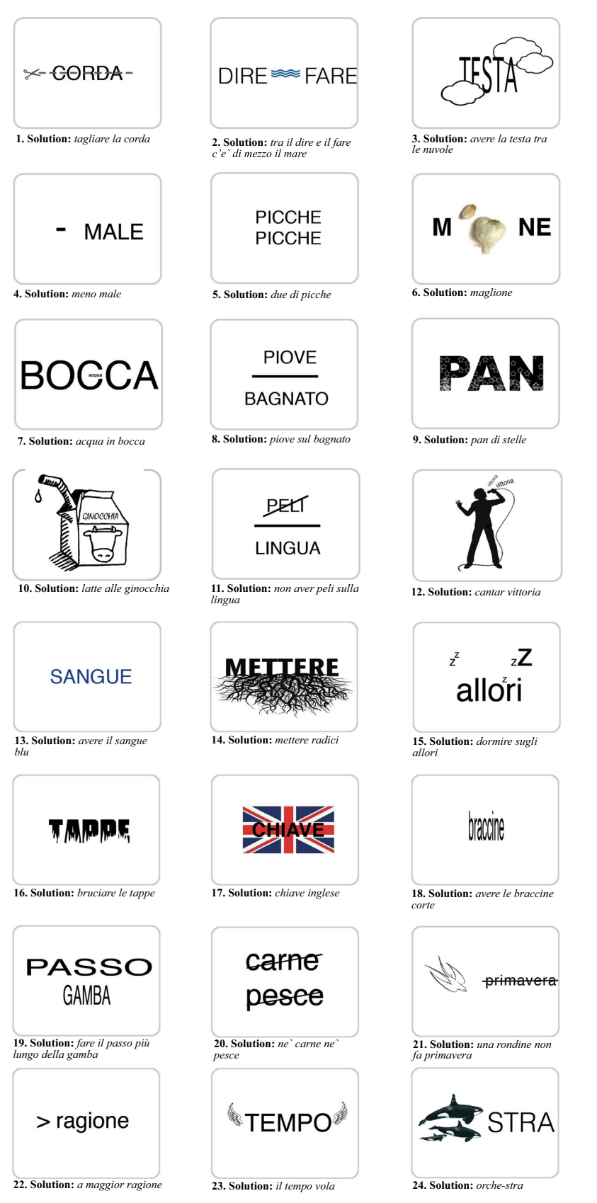
Fig. 3 The rebus puzzles are sorted with higher percentages of solutions first. An extra potential solution has been identified for Problem 83 Più di tutto