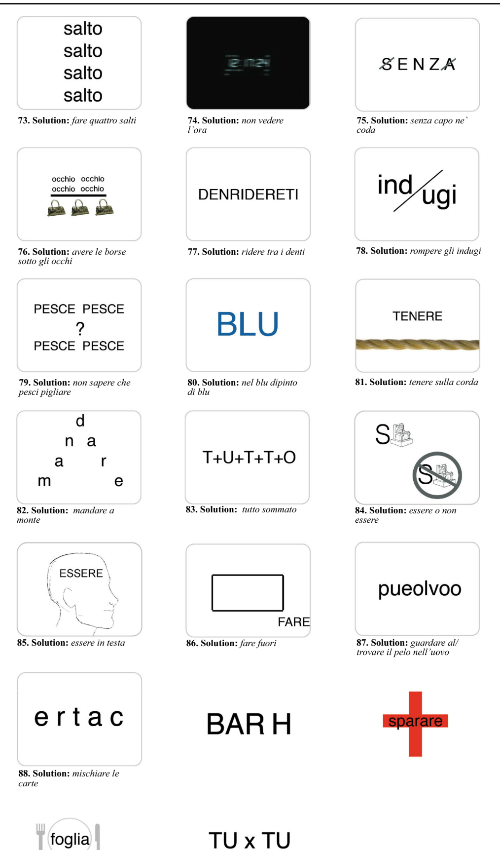
Fig. 3 (continued)