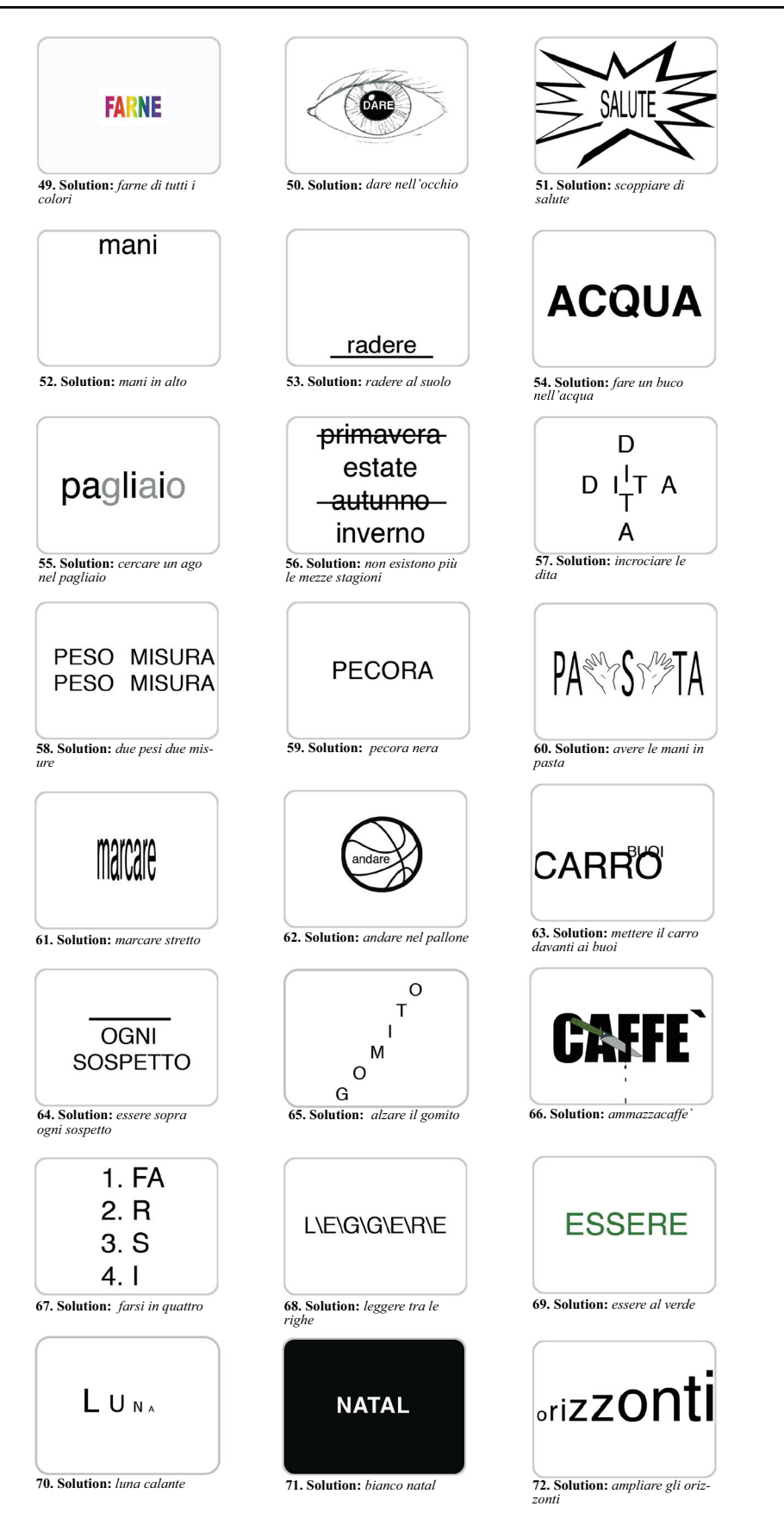
Fig. 3 (continued)