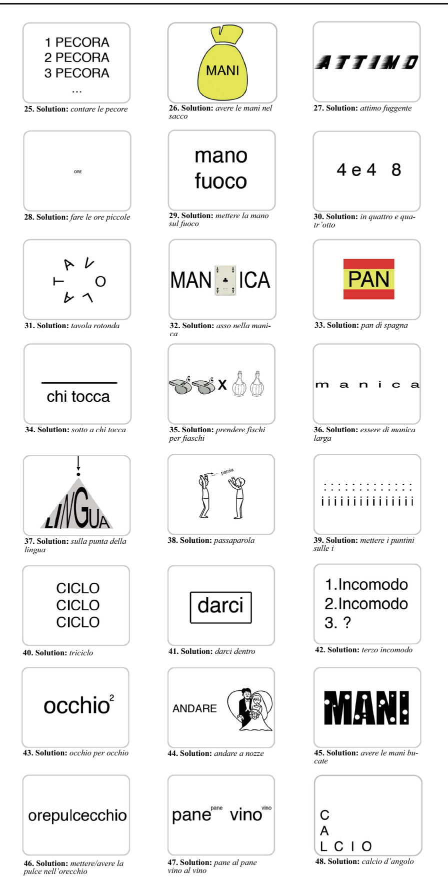
Fig. 3 (continued)